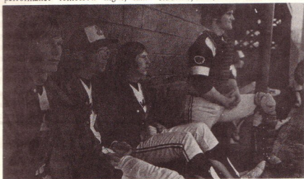
Our members of the Lanphier Baseball Team watch the action from the dugout.

Tickets are available at the door. Prices are $1.50 for adults, $1.00 for students, and $.75 for children.